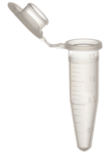
1.5 mL Tubes – US16155500