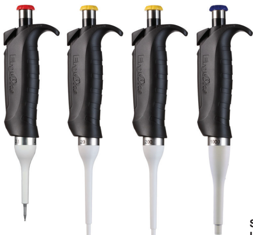
Single Channel Set US71041221