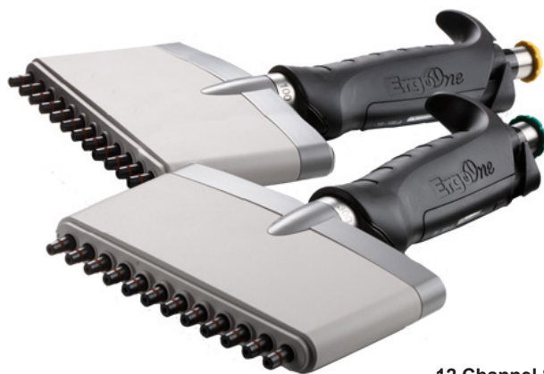
12 Channel Set US71123530