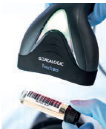
Scanning the sample IDs or manual input