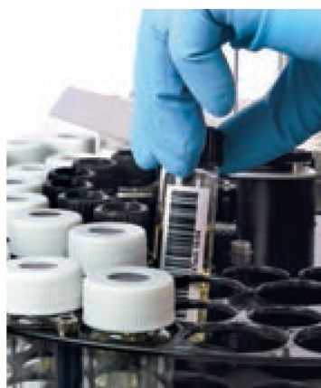
Placing the samples