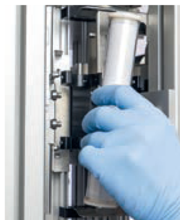
Insert the ready-to-use columns in the carousel and press „Start“.

DEXTech 16 processes 16 samples one after another without any manual working step in between separating the PCBs and dioxins /dl-PCBs.