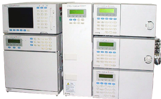
LC-10AD, 10ADVP, 600, 9A, 2010, 20-AT, 20-AD, 20-AB