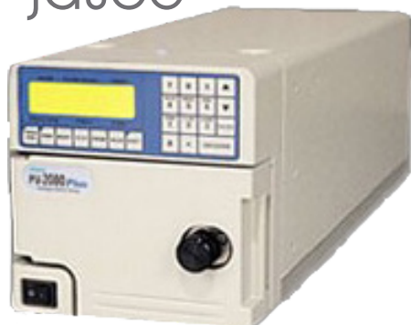
BIP 1, 880/890 SERIES