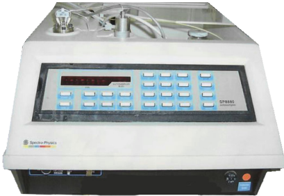
(THERMO) 8700, 8800, ISOCHROM, P-SERIES, 8700XR, 8750