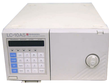
LC-10AT, 10ATVP, 10AS, 6A