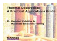
Residual Volatiles & Materials Emissions Testing GNTG1035