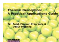
Food, Flavor, Fragrance & Odor Profiling FFTG1037