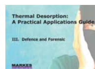
Defense & Forensic CFTG1036