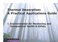
Environmental Air Monitoring and Occupational Health & Safety EVTG1034

Thermal desorption application guides are available for a broad range of markets. Request your FREE copy today using these part numbers.